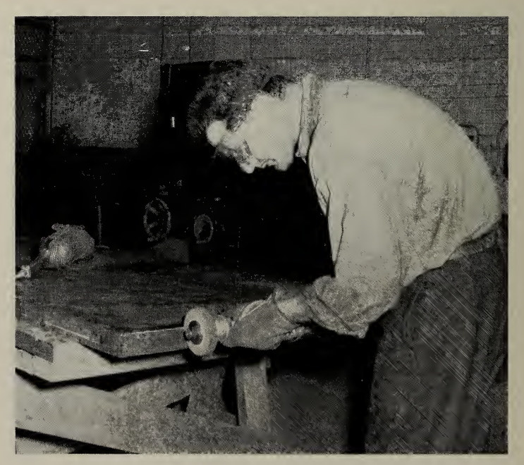
One of many Institution projects-metal covered fire doors.